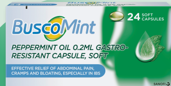
Peppermint oil 0.2ml

Herbal medicinal product for multi-symptom relief in IBS, including the symptomatic relief of abdominal pain, minor spasms, bloating and flatulence.